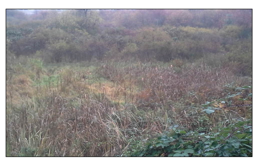
Figure 14: The Mills Street Marsh is characterized by bulrush beds and willow and hardhack borders. The marsh is located between saltmarsh a residential environments. Himalayan Blackberry grows on the residential property bordering the south side of t marsh.

The locally rare cattail marsh environment is located on private property next to the estuary, with a wide variety of wetland specialist species (Figure 18). The property owners have expressed support for the protection of the wetland and are interested in conservation and management options. This wetland will be described as the Mills Street Marsh for the purposes of this report.