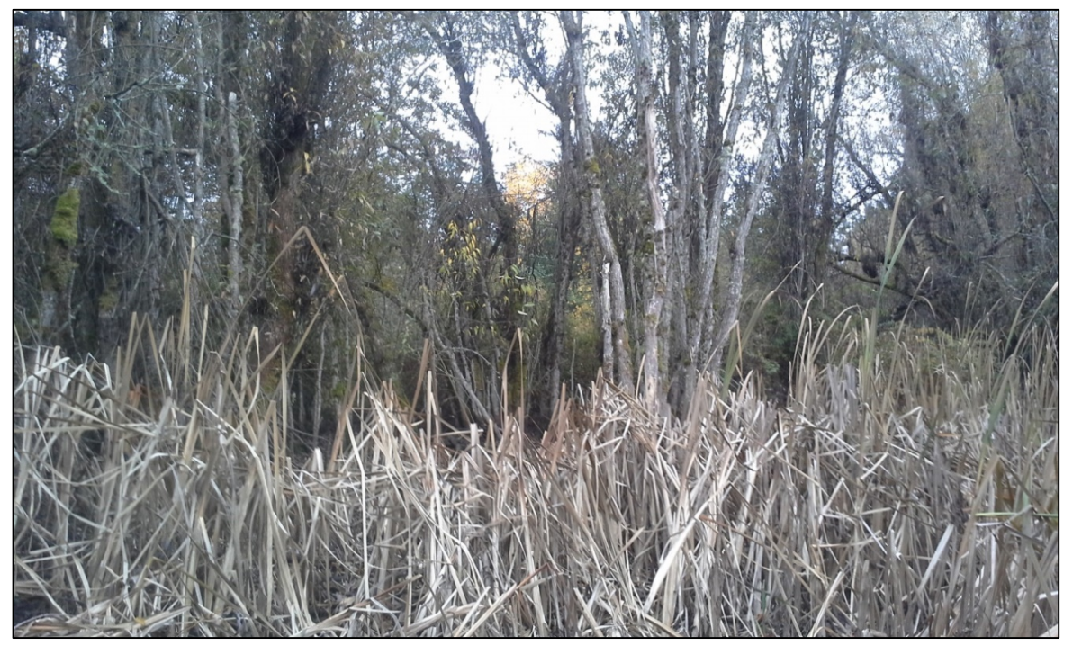
Figure 7: Open water and bulrush transition to dominant willow swamp matrix in the Doehle Avenue Wetland. This wetland provides locally scarce bulrush and swamp habitat.