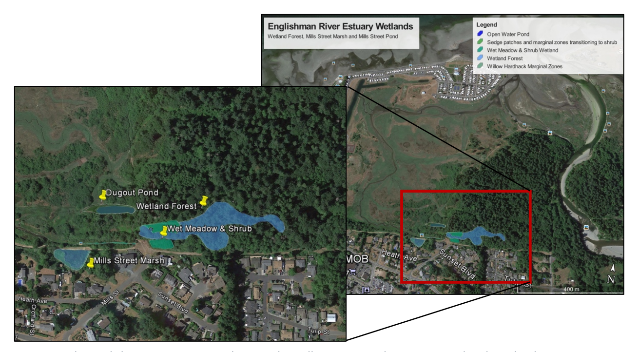
Figure 13: The Englishman River Estuary showing the Mills Street Marsh, Dugout Pond and Wetland Forest in context. The wetlands and associated rivulets are concentrated at the inland mid portion of the estuary bordering forest, grassland and urban zones.