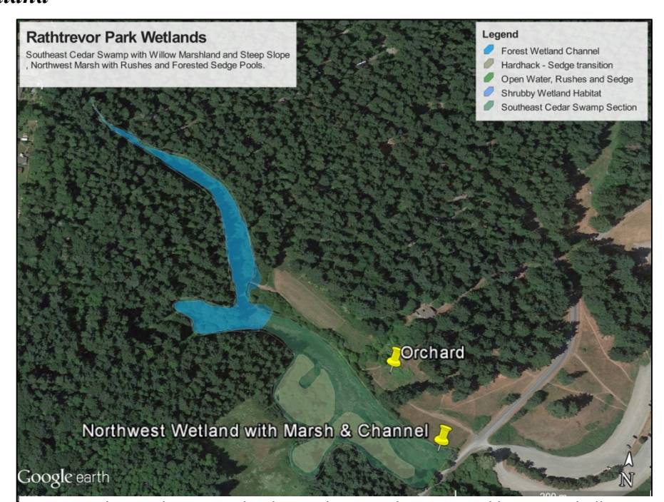
Figure 11:The northwest wetland at Rathtrevor characterized by open, shallow water pools dominated by rushes and a forest wetland arm with sedge and salmonberry covered channels.

The main portion of the northwest wetland is located east of a footbridge, with open marsh conditions and high levels of organic