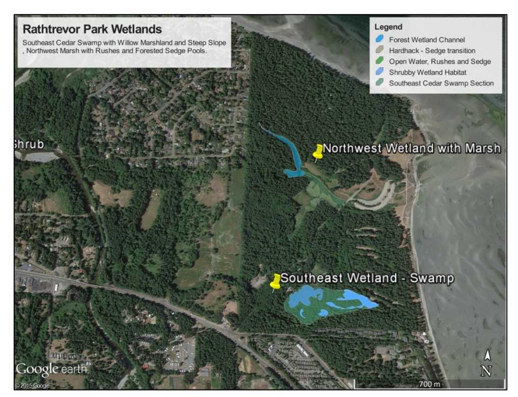
Figure 8: The two freshwater wetlands at Rathtrevor Park make up 6.75 ha of the total park area, forming a significant percentage of the non-marine section of the park.