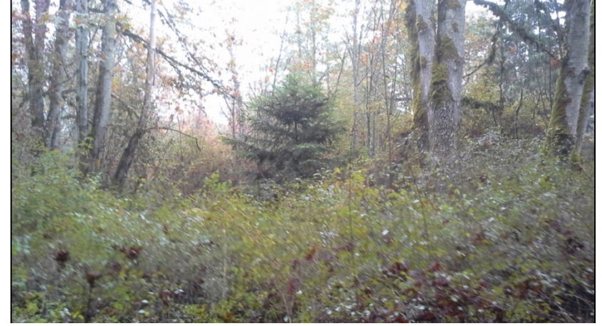
Figure 4: Romney Creek riparian zone section in the Ermineskin Nature Park defined by a Big-leaf Maple Canopy, Snowberry understory, moderate shade and abundant birdlife.

values such as habitat provision, water retention, filtration and groundwater recharge. It is located on top of Aquifer 216 and is likely hydraulically connected to the Parksville Wetland (although separated by the rail line). The surrounding forest (Figure 8 & 9) provides an important ecological buffer.