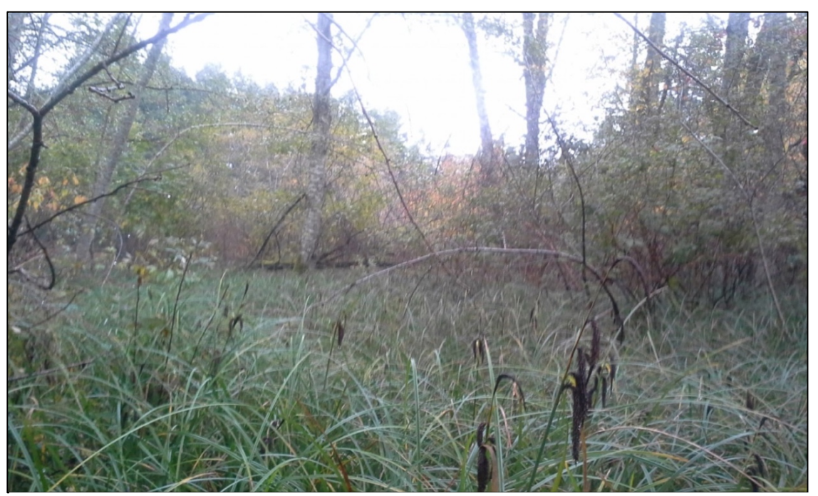
Figure 10: Southeast wetland at Rathtrevor characterized by slough sedge dominated marsh/swamp transition areas, mixed shrub cover and red alder patches in between the central marsh habitat and surrounding western red cedar swamp matrix.