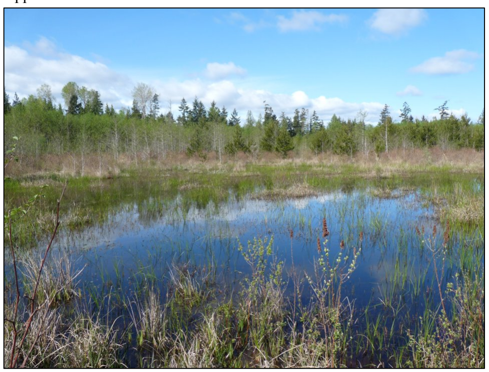
Figure 3: Parksville Wetlands main pool with the Ermineskin Nature Park in the background.

The Parksville Wetlands is located at the southwest edge of the City of Parksville (Figure 6). The Parksville Wetlands (Figure 7) forms the headwaters of Carey Creek, is positioned above Aquifer 216 which is the City of Parksville's water supply. For further details about the water supply see Appendix 1.