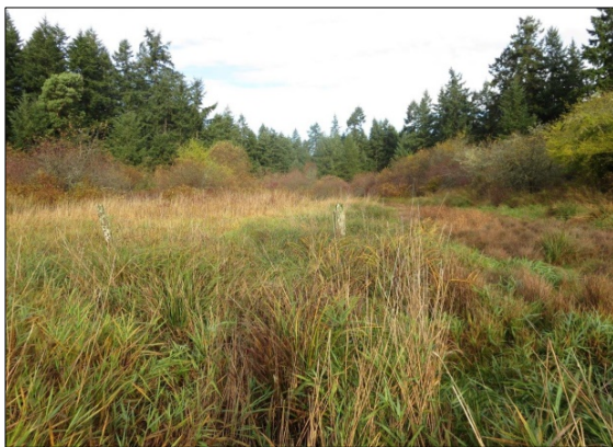
Figure 12: Northwest wetland at Rathtrevor with rush tussock section (left) and nearby wet meadow zones (right), bounded by Hardhack and Pacific Crabapple to the east, and Douglas-fir and western red cedar/grand fir wetland forest to the west.

To the west of the footbridge, the wetland narrows sharply, and forms a long, thin tapered arm approximately 26 m across at the midpoint covering an area of approximately 0.76 ha. This wetland extension accounts for the remaining 30% of the wetland and is characterized by slough sedge, hardhack, salmonberry and skunk cabbage, with overshadowing mature Douglas-firs, scattered grand fir and bigleaf maple. The effect is a more swamp-like condition with a moister, cooler environment with less herbaceous vegetation and marginal vegetation present. The soil has more clay and organic content and slightly less sandy compared to the main pool with rushes. The lack of rushes is a significant differentiating factor between the two sections.