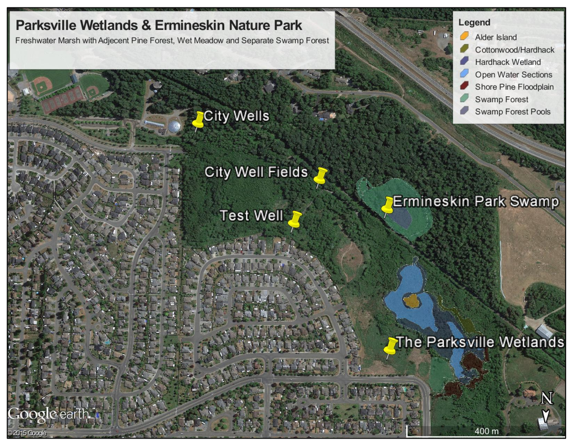
Figure 2: Google Earth Map of the Parksville Wetlands Study Area

Figure 6 shows the location of both the Parksville Wetland and Ermineskin Nature Park. Table 2 summarizes the geographic setting of the wetlands.