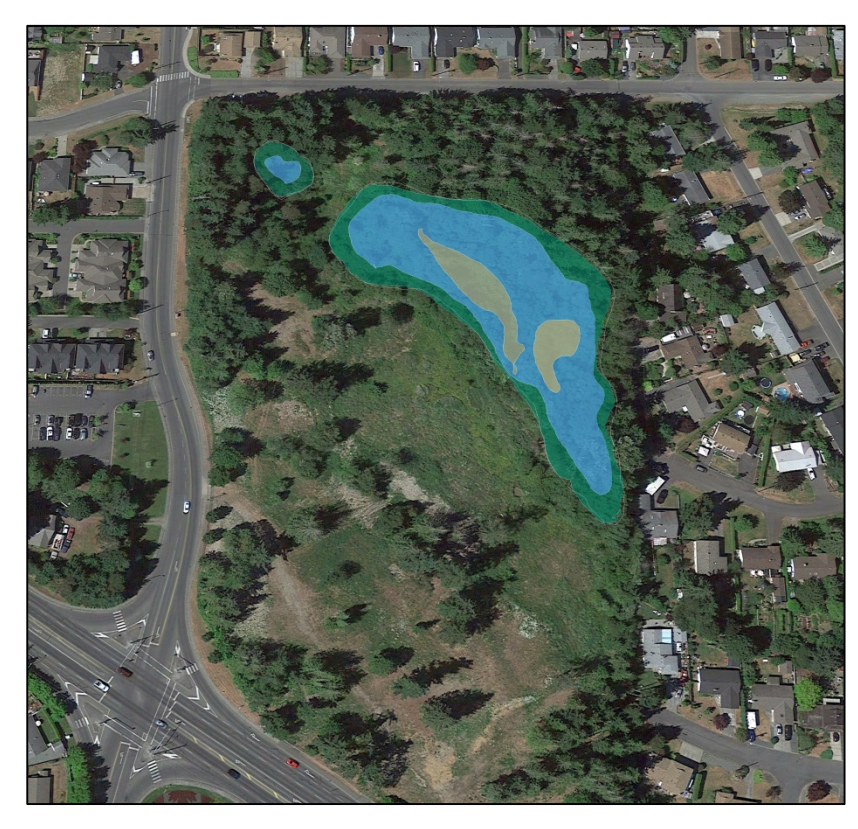
Figure 6: The 0.79 ha Doehle Avenue Wetland by the Parksville RCMP Station, with thick organic mud, willow swamp and bulrush habitat to the East with adjoining 0.049 ha pocket swamp to the northwest.

The Doehle Avenue Wetland is a rare willow swamp ecosystem reminiscent of Louisiana wetland environments, with widely spaced willows and swampy soils. The main wetland area covers 0.56 ha, the remaining 0.23 ha is occupied by the transitional zone (the area between open water and the edge of the wetland) that ranges in width from three to fourteen meters.