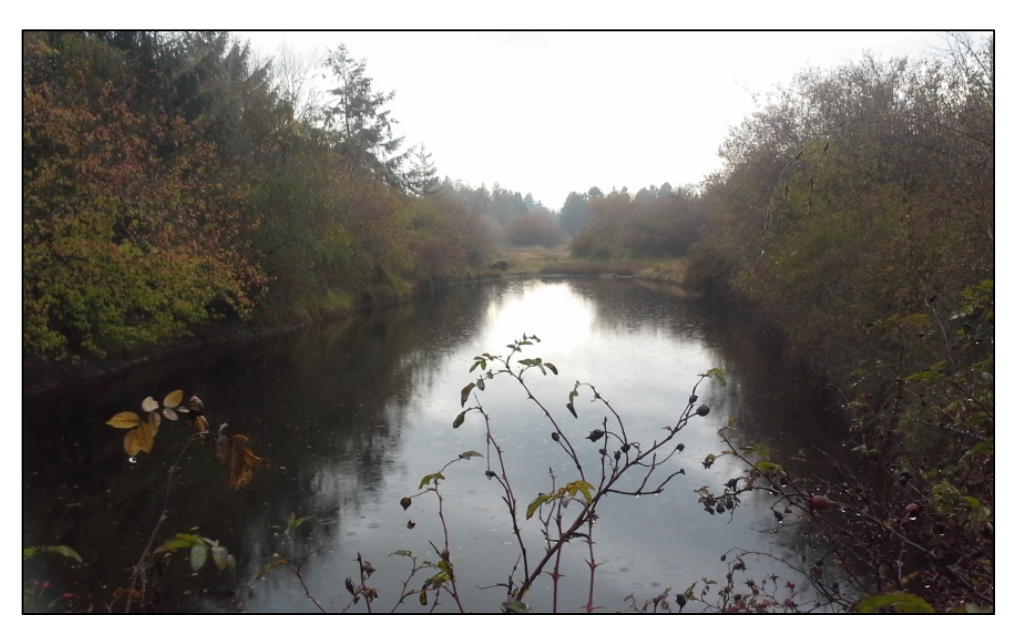
Figure 16: The dugout pond near Mills Street exhibits deep water, brackish conditions and a sharp transitions from aquatic habitat to terrestrial habitat. Marginal zones and shallow water are limited with only a small rush bed at the west end.

Located 60 meters north of the Mills Street Marsh a manmade pond occupying 0.09 ha (Figure 20). The pond consists of 0.06 ha of open water habitat with steep sides and water depths estimated to be less then one meter. The remaining 0.03 ha of habitat is comprised of a one meter drop off with a sharp transition from open water to bordering terrestrial habitat along the eastern side of the pond and up to a 0.2 m drop transitioning from grassland and some saltmarsh environments along the western edge of the pond.