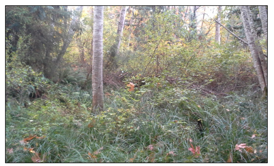
Figure 17: Englishman River Estuary Wetland Forest is characterized by extensive sedge beds with standing shallow water, bordering salmonberry and a forest canopy with a cover of around 65 %, with interspersed western red cedar and red alder with scattered grand fir.

The 21.44 ha coastal plain forest on the Shelly Road and Mills Street side of the Englishman River Estuary contains wetland forest and shrubby wetland habitat consisting of a 0.61 ha wetland forest. Standing water occupies extensive patches of habitat during the wet seasons, with predominant vegetation consisting of slough sedge in these pools, as shown in Figure 21.