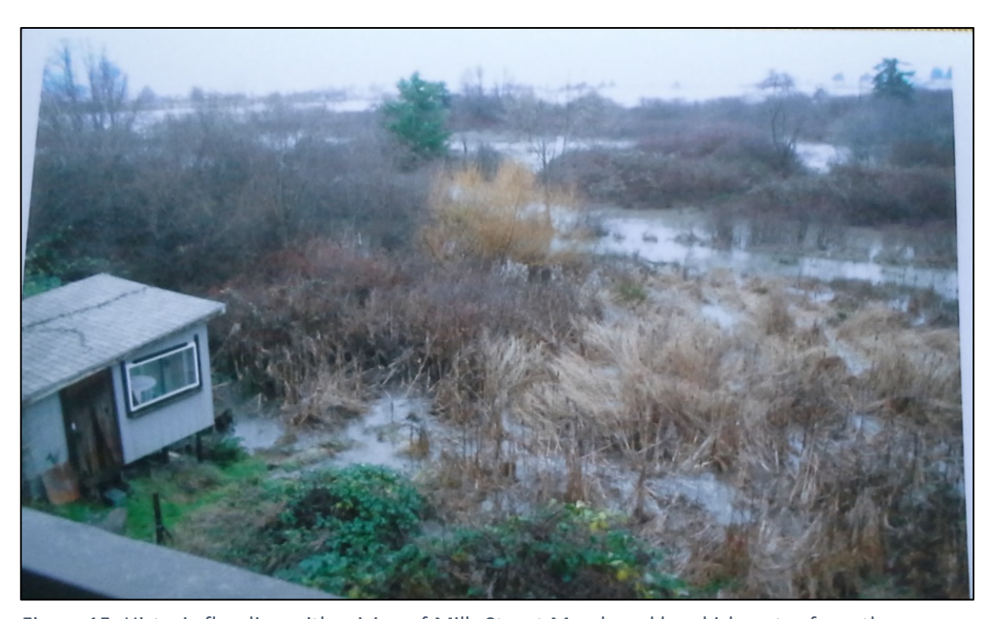
Figure 15: Historic flooding with mixing of Mills Street Marsh and brackish water from the Englishman River estuary saltmarsh section.

Photographs of significant historic flooding during combined high tide and heavy rainfall conditions showed large quantities of water exchanged from the wetland into the estuary as shown in Figure 19. This wetland provides flood mitigation and water retention values.