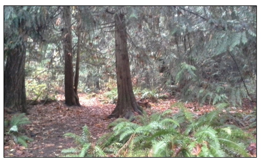
Figure 5: Western red cedar/red alder forest represents a significant portion of the transitional vegetation of surrounding the swamp habitat making up the Ermineskin Nature Park wetland, acting as an ecological buffer.