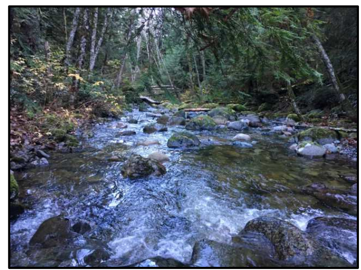
Photograph 1 : Benson Creek sampling location. (November 2018)