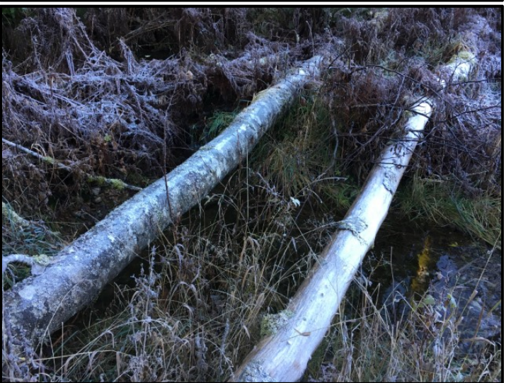
Photograph 9: Lower W1500 Creek sampling location.(November 2018)