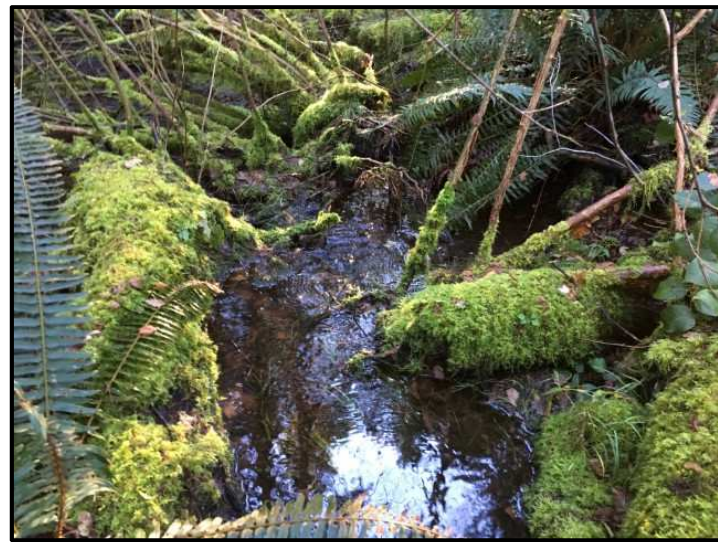
Photograph 4: Upper Caillet Creek sampling location. (November 2018)