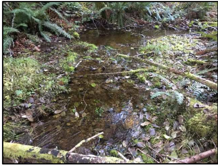
Photograph 7 : Lower Bonnell Creek sampling location. (November 2018)