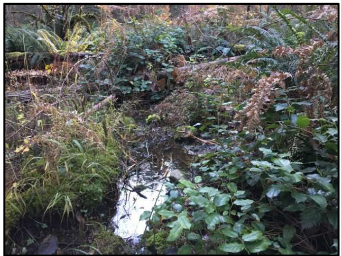
Photograph 2: Upper Flynfall Creek sampling location. (November 2018)