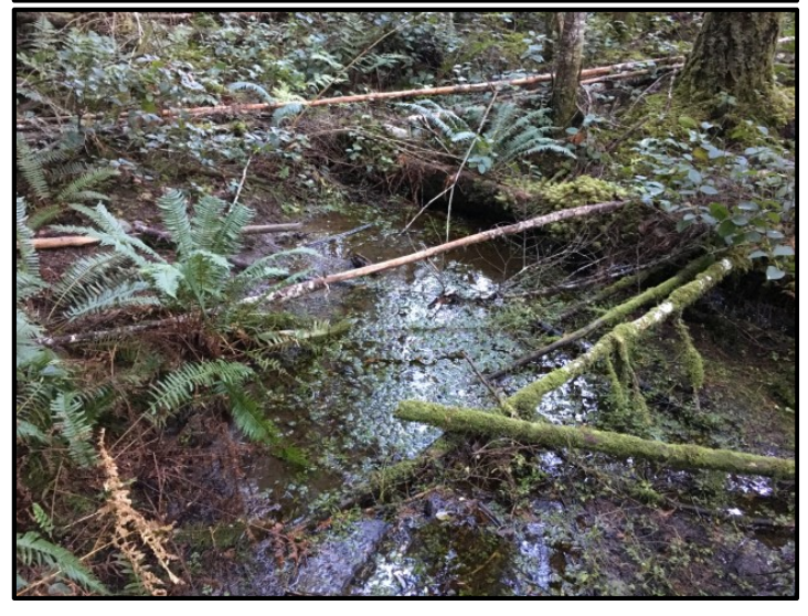
Photograph 6 : Upper Bonnell Creek sampling location. (November 2018)