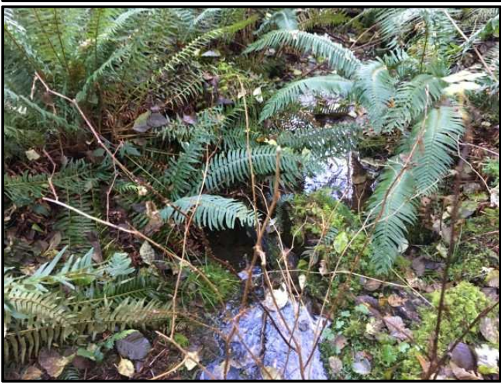
Photograph 8 : Upper W1500 Creek sampling location. (November 2018)