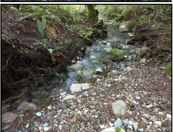
Photograph 3: Lower Flynfall Creek sampling location. (November 2018)