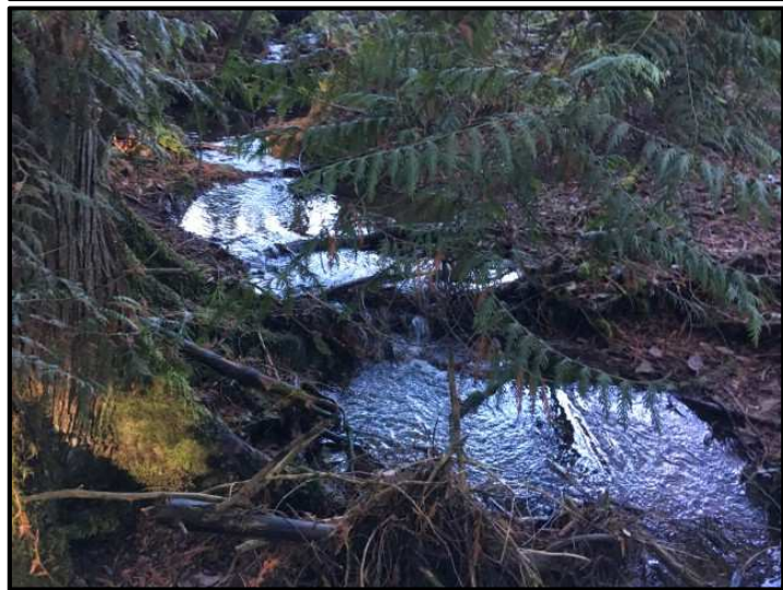
Photograph 5 : Lower Caillet Creek sampling location. (November 2018)