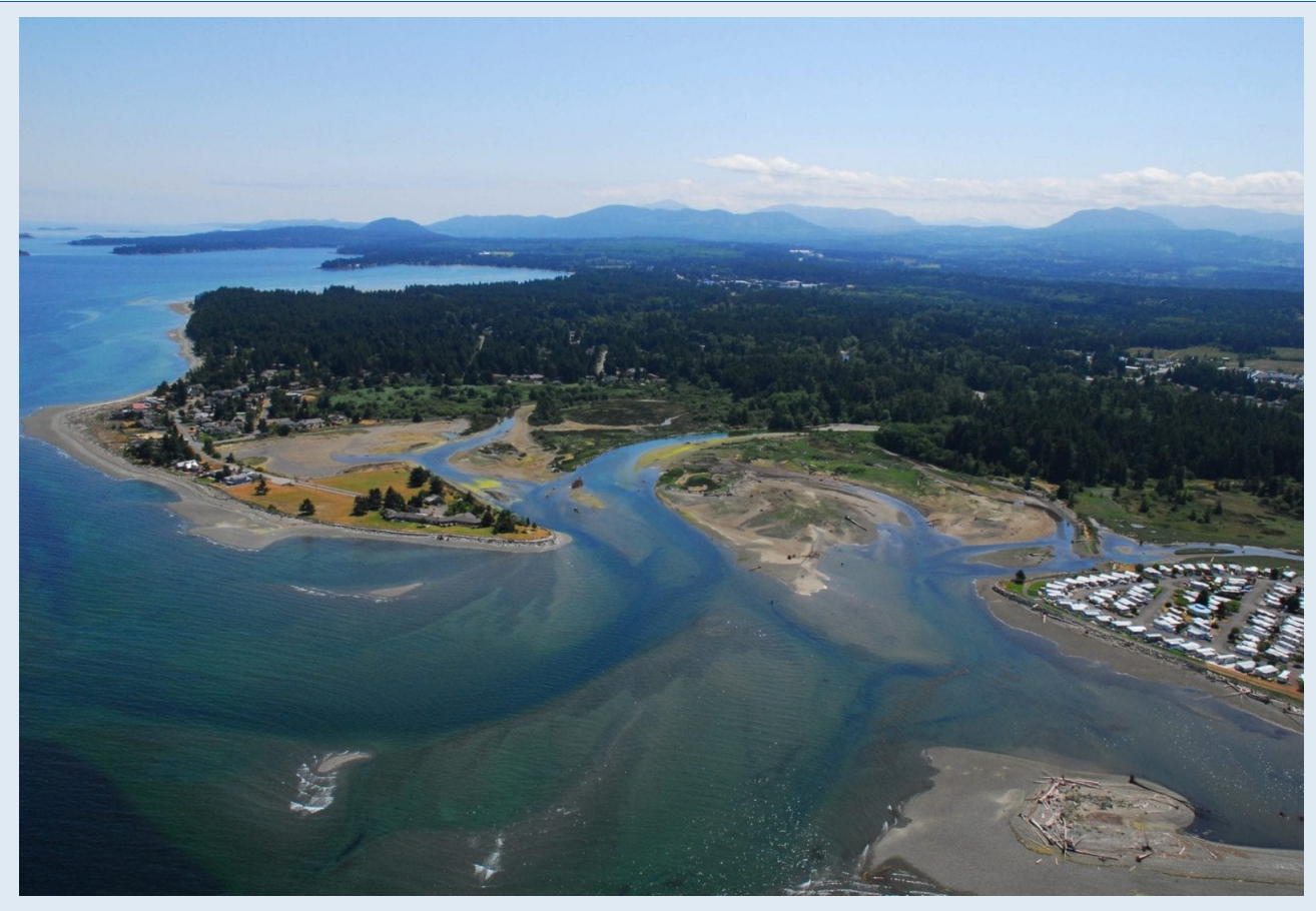
Englishman River Estuary