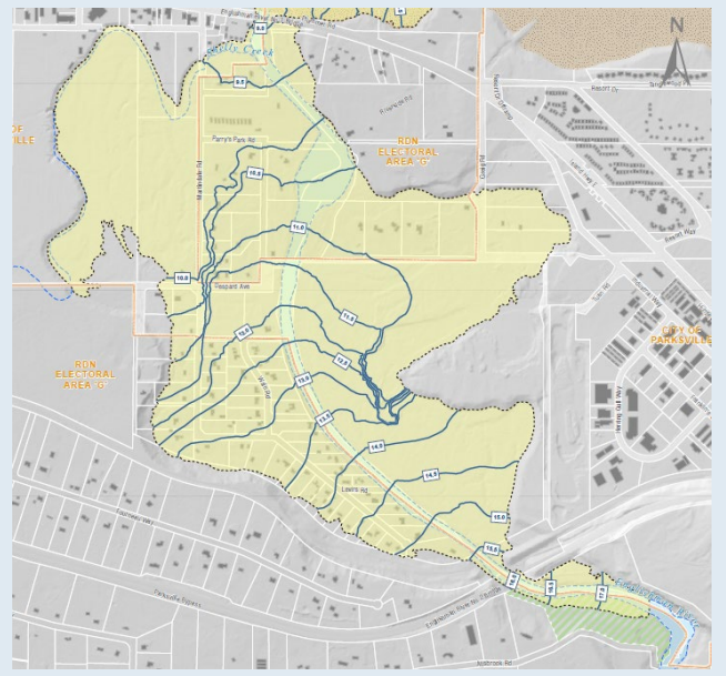
Excerpt: Map Sheet 2 of 2