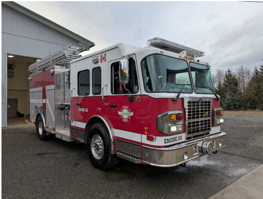
New fire engine