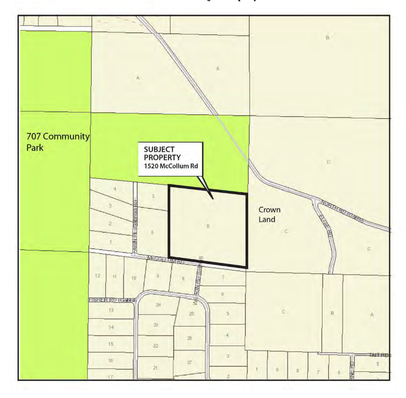
Attachment No. 1 Electoral Area 'B' Parks and Open Spaces Advisory Committee Consideration of Park Land, 1520 McCollum Rd Location of Subject Property