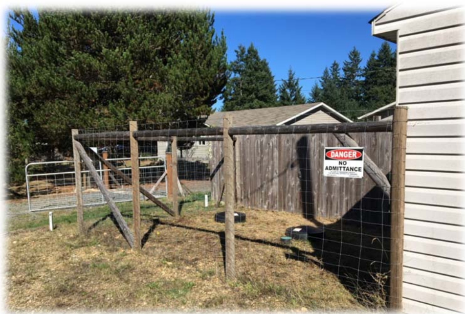
Well site and fence