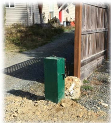
Water Sampling Port on Westurne Heights Road

An annual report for the year 2018 will be prepared and submitted to Island Health in the Spring of 2019. Annual reports are also available on our website at www.rdn.bc.ca in the SERVICES section, under “Water & Utility Services” then “WaterSmart Communities”.