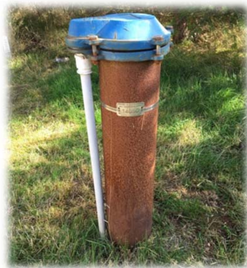
Westurne Heights Well #1

Note: 'PVC' is poly-vinylchloride (plastic)