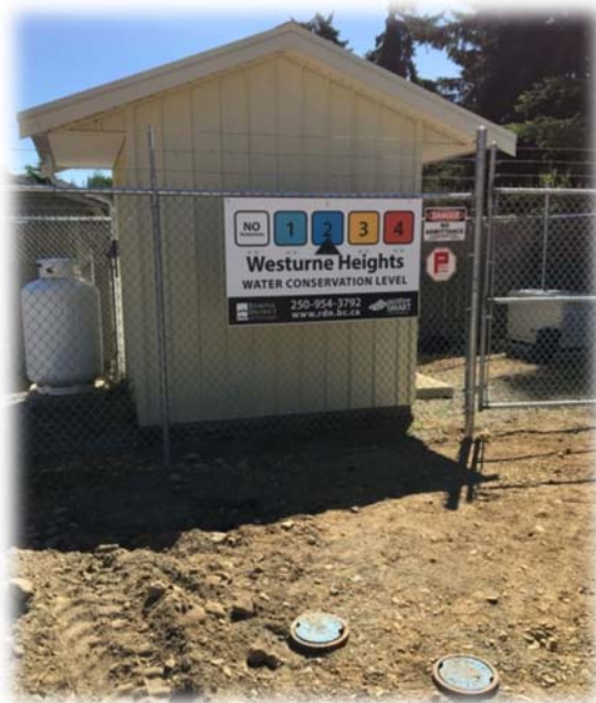
Westurne Heights Pumphouse and Buried Cisterns

Up-to-date water quality reports and lab data are posted monthly on the RDN website at www.rdn.bc.ca in the Services section, under “Water & Utility Services” then “WaterSmart Communities”. Tables of water quality testing results for both the source water and distribution system are provided at the end of this report under Appendix B. Bacteriological results are posted on the Vancouver Island Health Authority (VIHA) website at: http://www.healthspace.ca/Clients/VIHA/VIHA_Website.nsf/Water-Samples-Frameset?OpenPage , then click on Qualicum Beach , then click Westurne Heights Water Service Area .