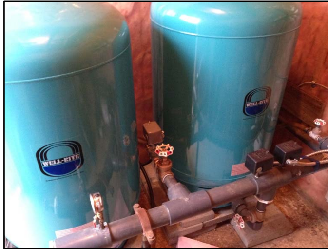
Pressure tanks in the pump house

The water storage cisterns are drained and cleaned once a year. Twenty-four hour on-call coverage is in place to respond to water system emergencies and alarms.