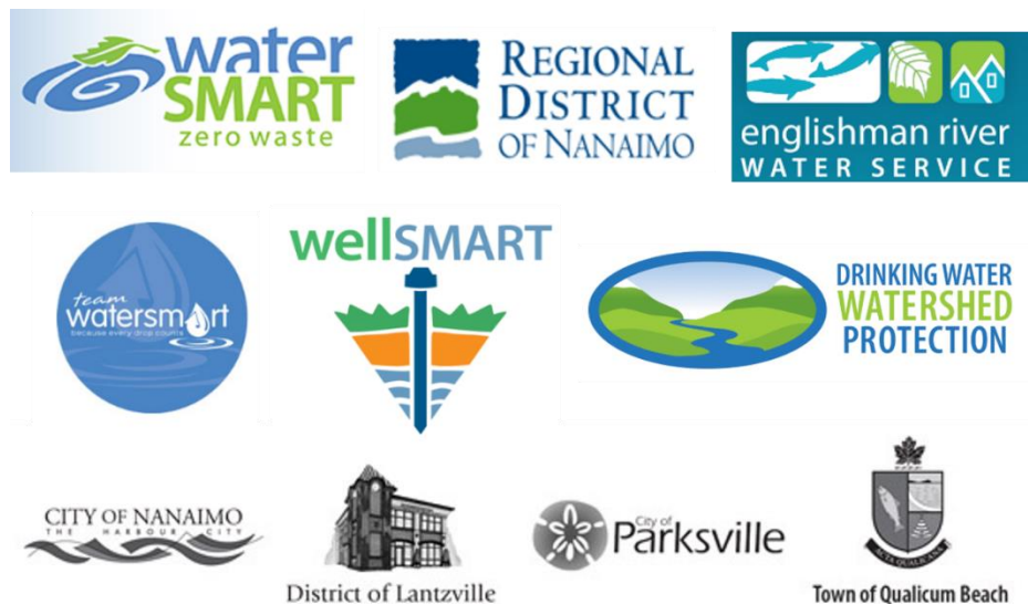
Figure 3: Logos Used in Drinking Water and Watershed Protection Communications

To illustrate, so far we have observed use of at least ten different logos and wordmarks in program communications (see Figure 3). In one instance, eight different logos were used on a single page. In a couple of cases (e.g., the wellSMART program) it is not immediately clear why a separate brand identify is required at all. This challenge is compounded by the fact that the logos of five different local governments including RDN must sometimes be incorporated into design.