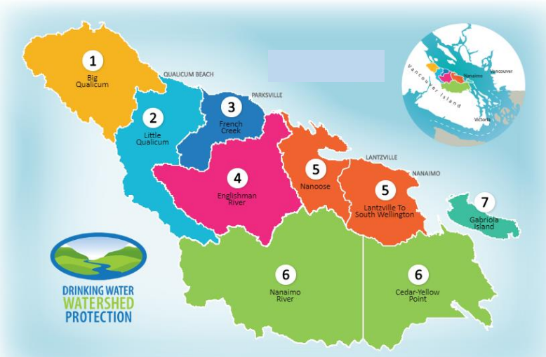
Figure 1: RDN Water Regions

The geographic scope of the program encompasses the entire RDN municipal boundary including all electoral areas and, since 2012, all four local municipalities. For example, benefits such as rebates are offered to all region residents. Implementation of science and data-related initiatives generally aligns with watershed and aquifer boundaries (see Figure 1). In some cases these boundaries overlap with surrounding regional districts.