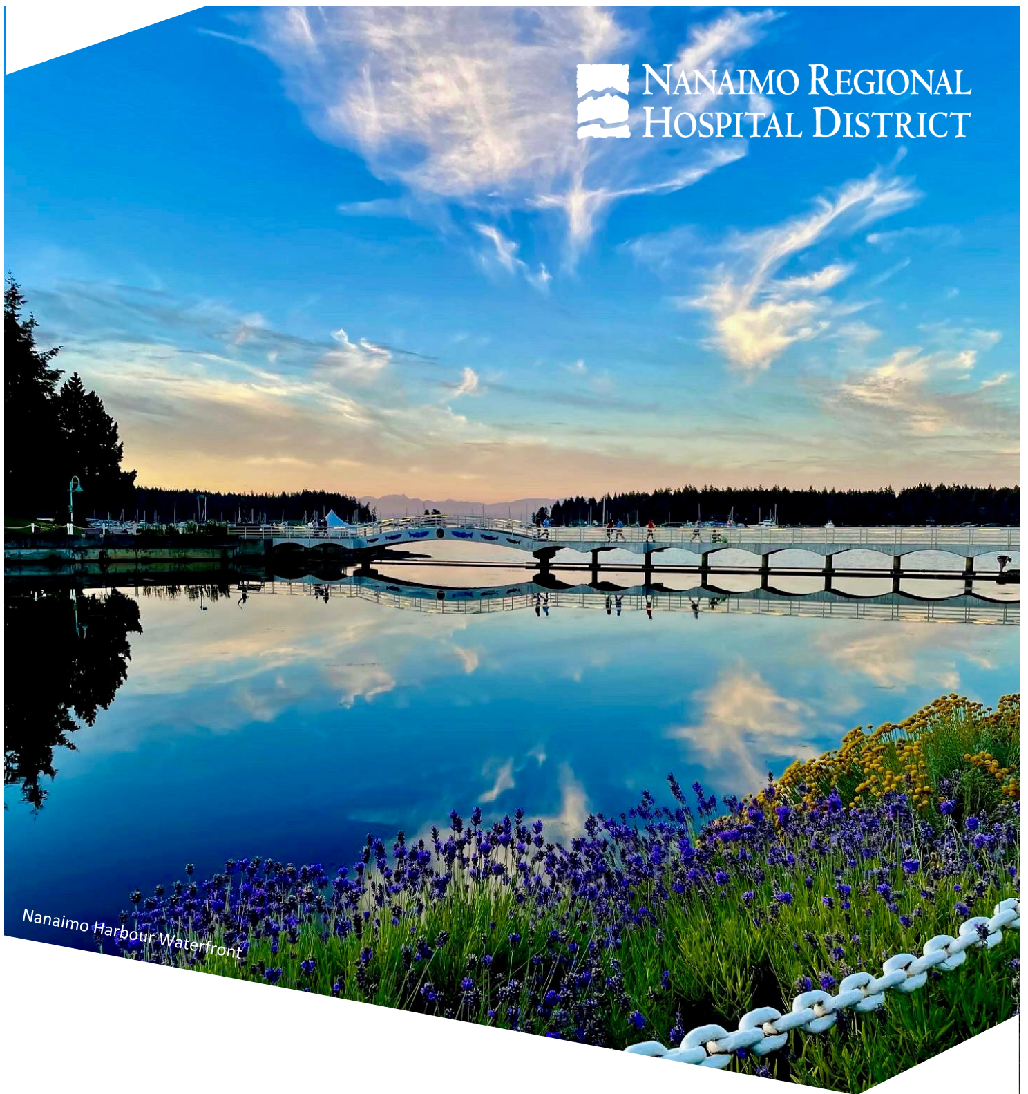
Nanaimo Harbour Waterfront