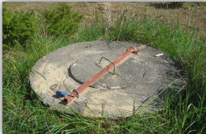
Rollo McClay Wellhead Cover in 2012

No complaints were received from the Rollo McClay Community Park Water System users. Inquiries were typically related to power outages.