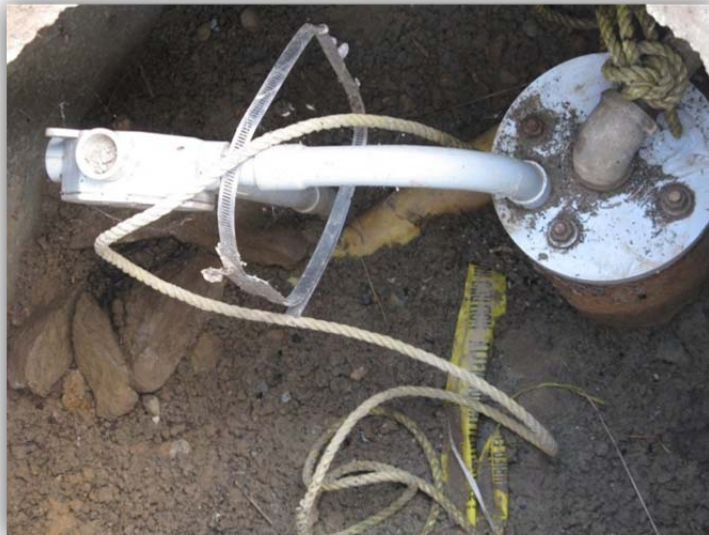
Rollo McClay Wellhead Close-up in 2012