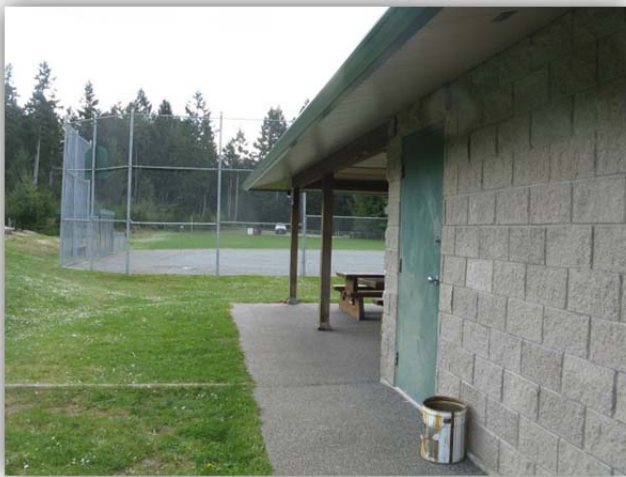
Rollo McClay Concession Building

One polyethylene cistern is located inside the concession stand building. The cistern has a capacity of 5.5 m 3 (1,200 imperial gallons).