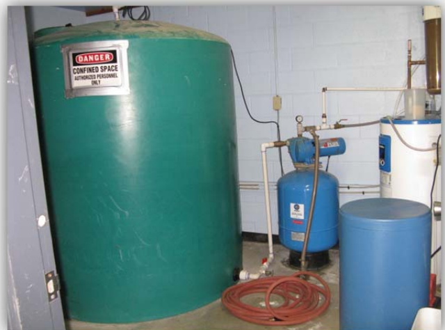
Rollo McClay Water Cistern